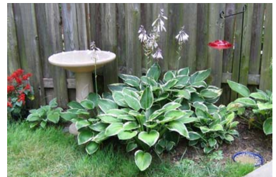
Backyard habitat in Lafayette Village—water, food, and shelter provide an enticing environment for birds

http://www.enature.com/backyardwildlife/nwf_bwh_home.asp