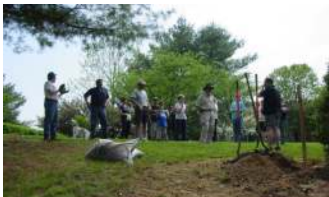
Arbor Day volunteers gather for tree planting.