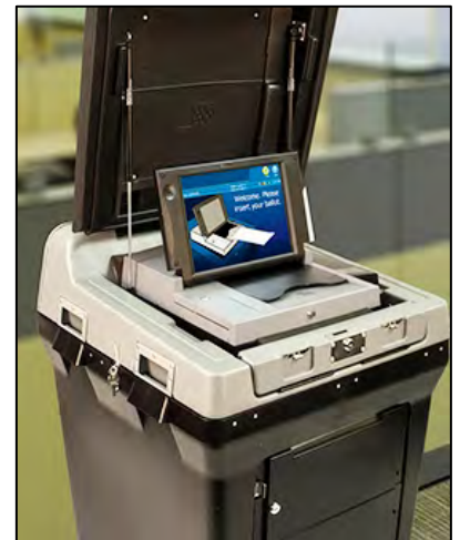
New voting machines will be used to record your paper ballot in the upcoming election.

Register to vote or verify your voter registration: If you are a new resident of Lafayette Village and want to register to vote, or you need to update your voter registration (name change, address change, for instance), you have until October 14, 2014 to do so. You can register or update your information online at https://www.vote.virginia.gov/ . Once you've registered, you will receive a new voter registration card in the mail before the November election. You can verify your registration information at that same website, https://www.vote.virginia.gov/ and make any necessary changes then.