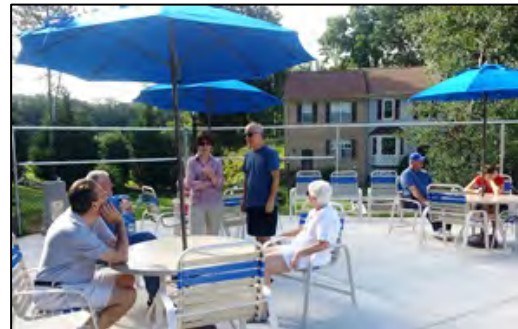
Residents enjoying the new pool picnic pad

The opening weekend cookout was the best attended pool event ever!