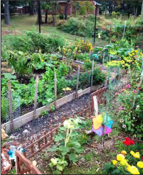
Garden crops and flowers

Most gardeners have seen cucumbers and zucchini the size of baseball bats, but this year I saw okra the size of baseball bats! Unfortunately, I did not figure out what to do with very large okra, other than laugh!