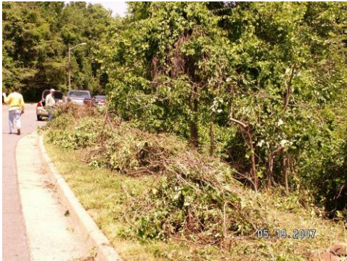
The results! These invasive weeds are awaiting removal by Fairfax County Park Authority.

Drive. Invasives frequently gain a foothold in transition areas, so removing weeds at those locations can be especially effective.