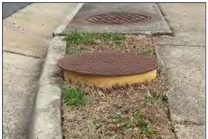
This water meter well on Hancock Forest has risen up over time and now presents a serious tripping hazard.

Fortunately, Fairfax Water can reset these water meter wells back in the ground. If you notice that the water meter well in front of your house has risen up, you can call Fairfax Water at 703-698-5800 to report the problem . A Fairfax Water technician will show up within a day or two to correct the problem, of course at no charge to you.