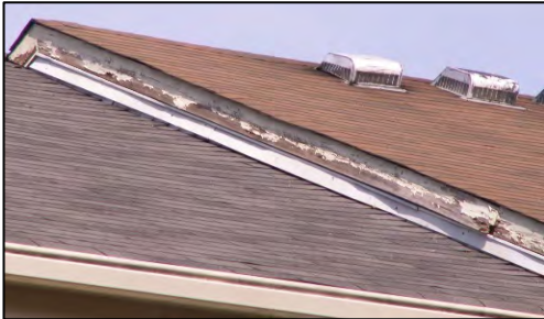
Rake board needs attention!

Second story siding along the roof line frequently comes loose, as in this house. Here the siding is so loose, it can't perform its job of shedding rain and water. Instead, water and snow can easily penetrate the siding and begin affecting the common wall between these two townhomes. A competent handyman can easily repair a situation like this without having to replace the siding (although, in this case, replacing it's not a bad idea).