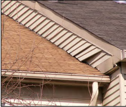
Upper story siding has come loose!

With the Spring ACC inspection coming up in March, now's the time to give your house a critical review. You can see what might need a bit of touching up, and get a head start on the inspection! One area homeowners often overlook is the roof. Here are some issues to look out for: