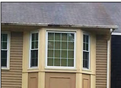
Gutter needs cleaning!.

This front yard tree was removed, but hasn't been replaced yet. Our ACC Guidelines require that all townhome trees must be retained and must be replaced as soon as practical. While the fall is the best time to plant trees, spring planted trees can grow successfully if you remember to mulch them and water regularly.