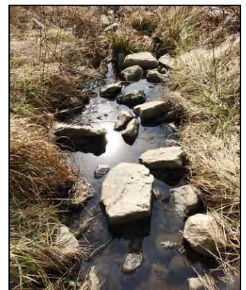
This stream by the retaining wall near the meadows was a focus of the clean-up

We expect to perform a reduced set of spring plantings this year while we prepare a more comprehensive community plan to use plantings for both beauty and function. We need to employ a mixture of plantings and stone or other drainage solutions to address a number of erosion concerns across the neighborhood that certainly are not getting better on their own. We hope to make better progress this year than in past years to address these concerns.