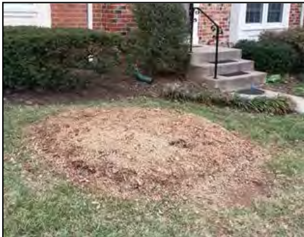
Tree needs to be replaced!

The rake board on this house needs repair – notice the break in the board at the bottom right of the photo – and repainting. Without this maintenance, the board is in danger of rotting and affecting the integrity of the roof. These boards are often difficult to see, so to get a good look, you may need to walk out to the middle of the street or into the common grounds at the back of your house.