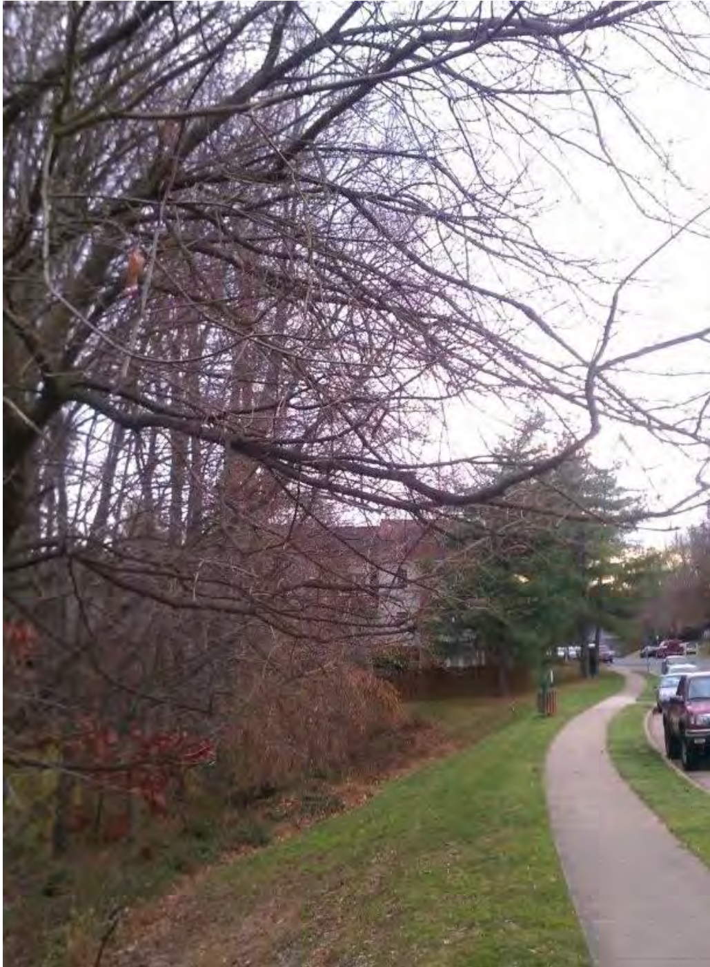
Photo 21: Mulberry with branches over Lafayette Village Drive sidewalk