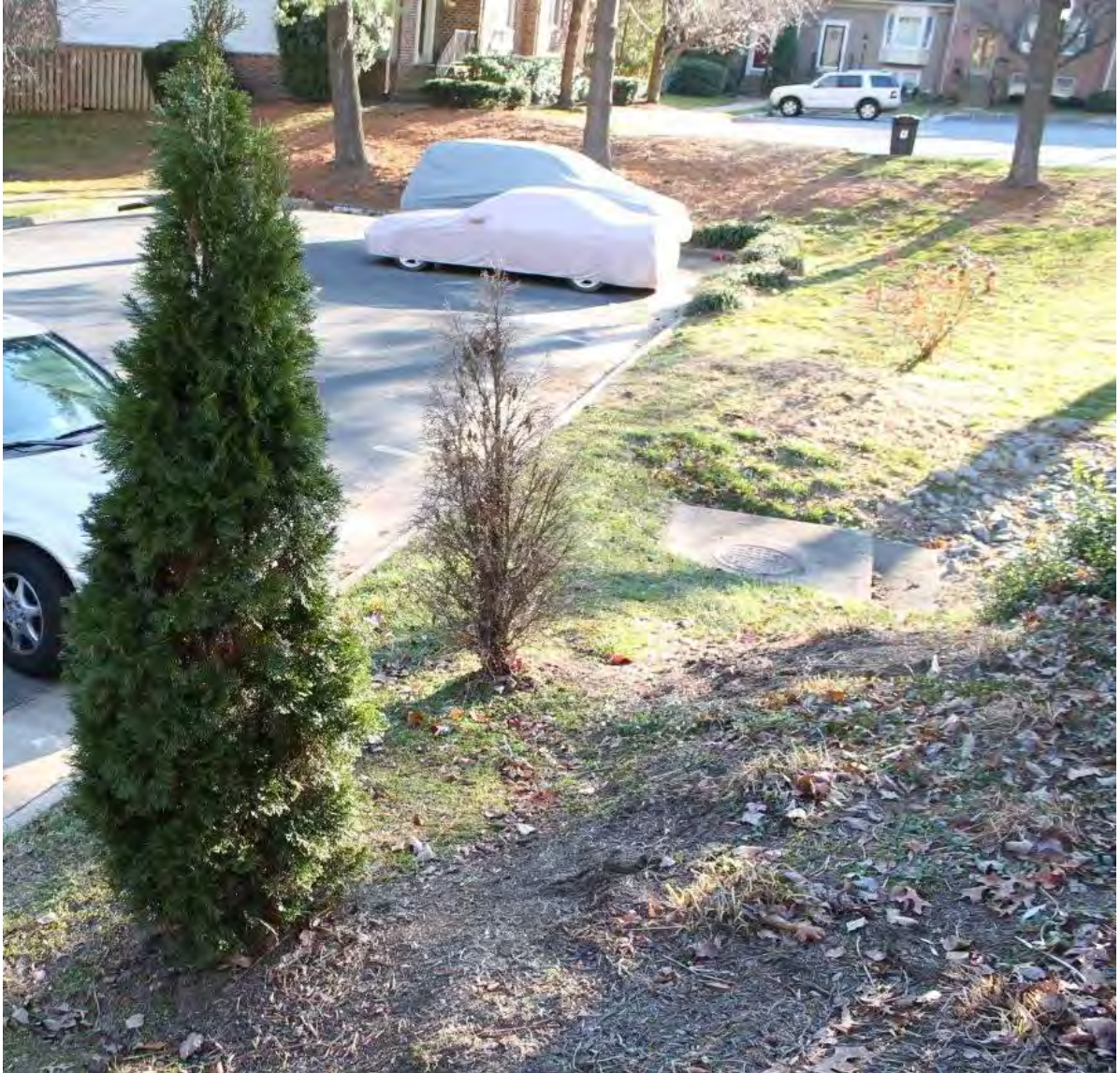
Photo 305E: Small dead 3' Arborvitae side of 7827 Ashley Glen Road