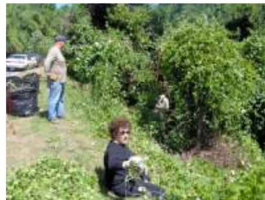
Residents work hard eliminate the invasive weeds.

The management company will be making sure that trash and toys are not being stored improperly in front of homes or in common areas for long periods of time. The bylaws are posted on the LVCA website. Both homeowners and renters are responsible for knowing and following the rules. Citations may be issued if you are not in accordance with the community guidelines. Fines will also be assessed.