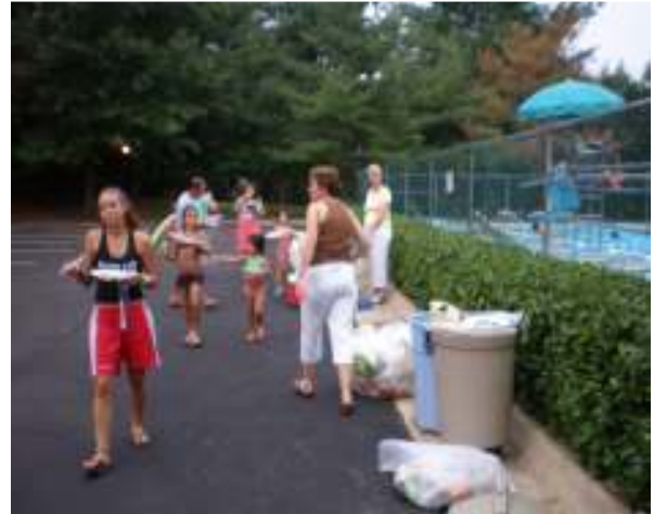
Residents enjoy the community barbecue.

The management company will be making sure that trash and toys are not being stored improperly in front of homes or in common areas for long periods of time. The bylaws are posted on the LVCA website. Both homeowners and renters are responsible for knowing and following the rules. Citations may be issued if you are not in accordance with the community guidelines. Fines will also be assessed.