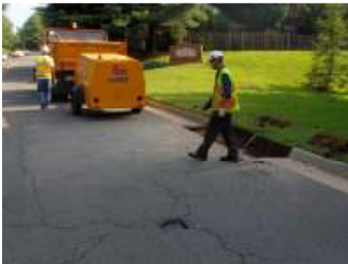
Crews fix curbs and cracked pavement in our neighborhood.

Please Note: The police have had several reports of GPS navigation systems (such as Garmin) stolen from cars. To prevent an incident in your neighborhood please completely remove the system when you are not in your car. Do not just put the system in your glove compartment or under your seat. Criminals are breaking in if they see the mount on the windshield or the mark from the suction cup for the mount and looking through the car.