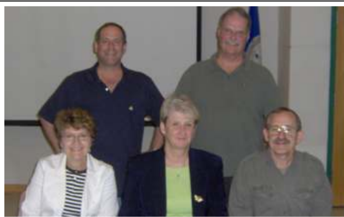
2007 LVCA Board Members (from left to right)