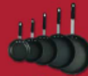
Pots & pans