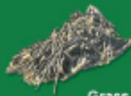
Grass, leaves, brush, mulch