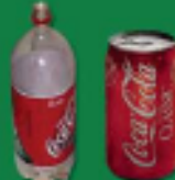
Soda bottles & cans