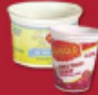
Yogurt, dairy tubs