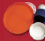
Lids, caps, tops