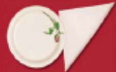
Paper plates & napkins