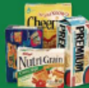
Cereal and cracker boxes