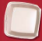
Foam take-out containers