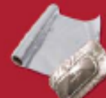
Aluminum foil & trays