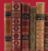
Hard back books