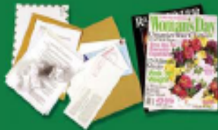
Junk mail, magazines, mixed paper and catalogs