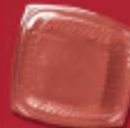
Plastic food boxes or trays