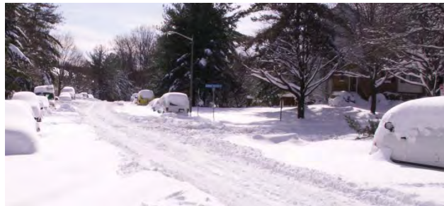
The Snows of Yesteryear!

Blade Runners will communicate with the chair of the Grounds Committee and the President of the Association. In turn, they will provide updates to you through the LVCA email list. If you do not already subscribe to the email list, now is a good time to begin – send your email address to lvcawebmaster@lafayettevillage.org and request to be added to the mailing. You'll then be assured of getting the latest snow updates this winter, as well as other valuable notices.