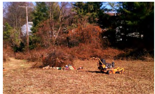
Site work at Community Gardens North

If you are interested in a plot or in volunteering to help prepare the gardens, please contact Anne Sansbury at asansbury@gicgroup.com to express your interest. We also need someone to volunteer as “Garden Master” for the new community garden.